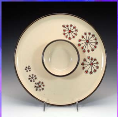
20 Beth Turnbull Morrish