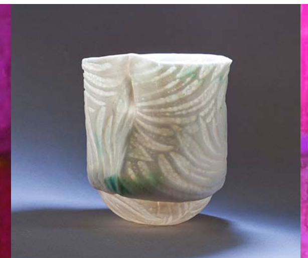
14 Bernadette Pratt