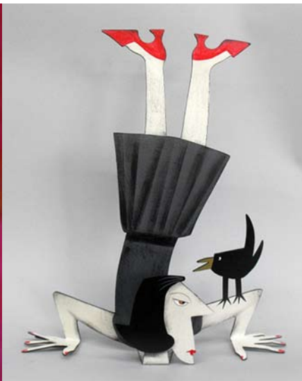
4 ACME Animal