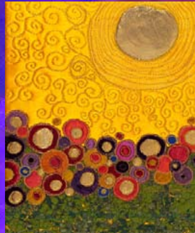
2 Vivian Tserotas