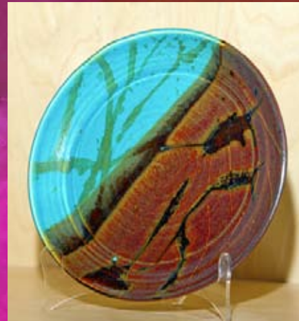
13 Elly Pakalnis