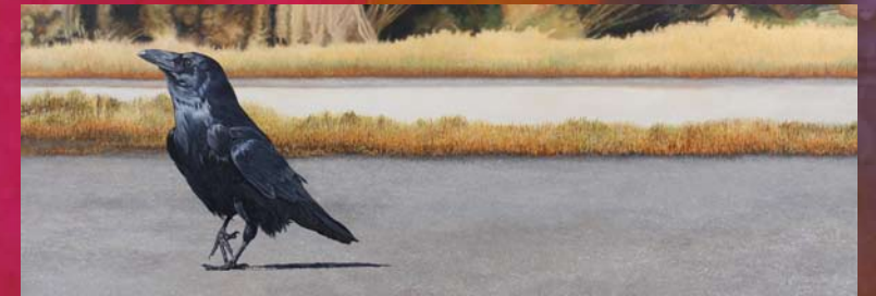
22 Angela Lorenzen