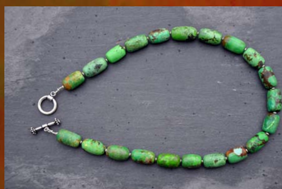
21 Susan Skaith

Friday April 13, 2012 7 pm - 9:30 pm Saturday April 14, 2012 10 am - 5 pm Sunday April 15, 2012 12 noon - 5 pm www.londonstudiotour.com