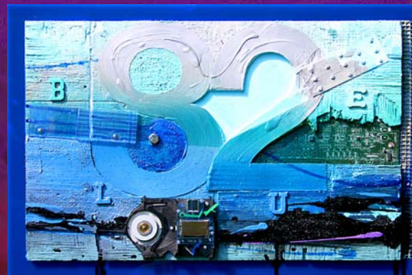
5 Cliff Kearns